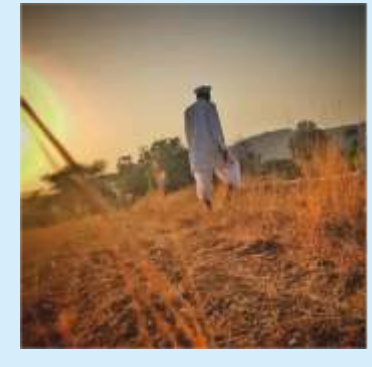
Saurabh Borse (TY, Computer Diploma)