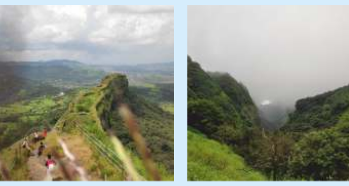
Pradip Gadge (TY, Mechanical Diploma)