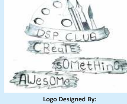
Shreya Pardeshi (SY Computer Diploma)