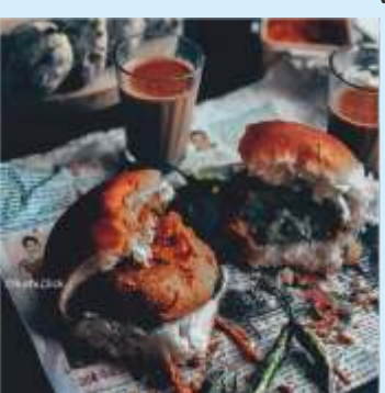
Shivdatta Pardeshi (TY, Mechanical Diploma)