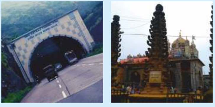
Pratik Taware (BE, Civil Engineering)