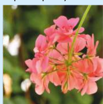
Ganesh Dhumal (TY, Mechanical Diploma)