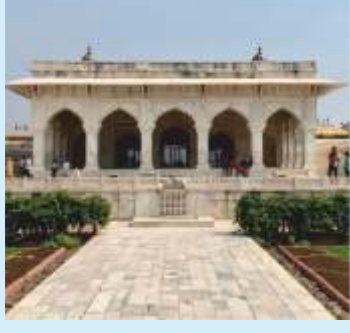
Ganesh Chourasiya (TY, Mechanical Diploma)