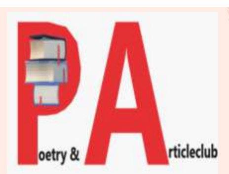
Logo Designed By: Dinesh Santosh Choudhari (TE, Computer Engg.)