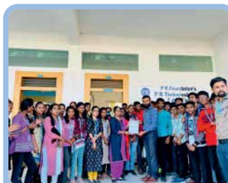
Certification for Trainings