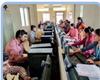
Online drive of students