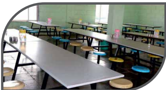
Canteen & Cafe