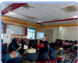
Technical training program