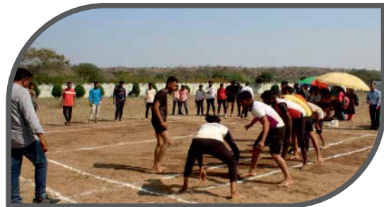
Indoor & Outdoor Sport Facilities