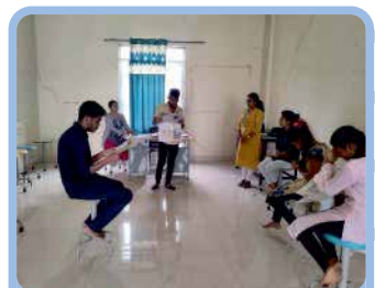
Group Discussion Activities