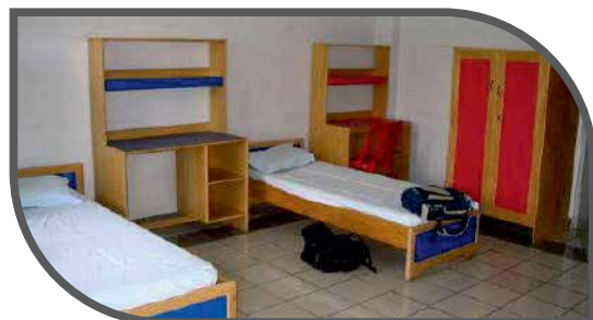
Separate Hostel for Boys & Girl