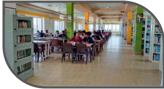
Library, Digital Lab & Reading Hall