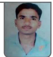
Appa Masal (Sumeera Food Ltd)